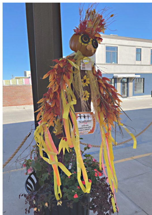
Scarecrows created by area organizations and businesses were placed in Festival Square and around the city creating a festive atmosphere throughout.

The library has utilized the Children’s Garden for programming: summer reading activities, after school crafts and even a snowman building contest. In honor of the themed updates a free outdoor movie event took place in August 2021 that featured the 1939 Wizard of Oz film. Improvements will continue as they are needed and as funds allow.